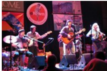
The SubDudes at a live taping of E-Town